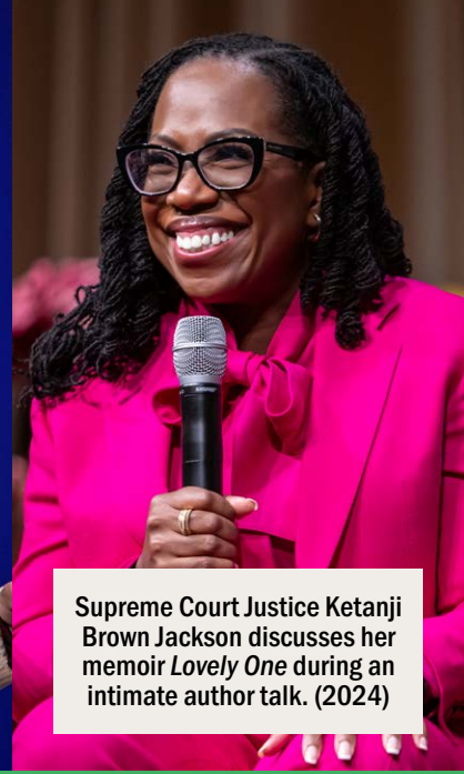
Supreme Court Justice Ketanji Brown Jackson discusses her memoir Lovely One during an intimate author talk. (2024)