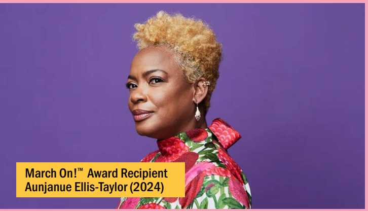
March On!™ Award Recipient Aunjanue Ellis-Taylor (2024)

The March On!™ Awards were established to recognize leaders and organizations whose commitment to advancing civil rights and social justice is unparalleled. Honorees exemplify the spirit of activism, advocacy, and creative expression that drives meaningful change. Through their work—whether in the arts, public service, or community leadership—recipients of the March On!™ Awards illuminate untold stories and inspire action in the ongoing struggle for equality and justice.