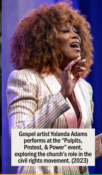
Gospel artist Yolanda Adams performs at the "Pulpits, Protest, & Power" event, exploring the church's role in the civil rights movement. (2023)