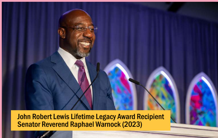
John Robert Lewis Lifetime Legacy Award Recipient Senator Reverend Raphael Warnock (2023)