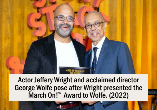
Actor Jeffery Wright and acclaimed director George Wolfe pose after Wright presented the March On!™ Award to Wolfe. (2022)