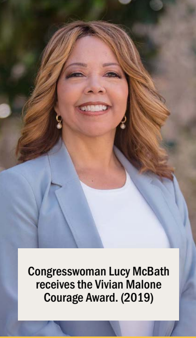
Congresswoman Lucy McBath receives the Vivian Malone Courage Award. (2019)