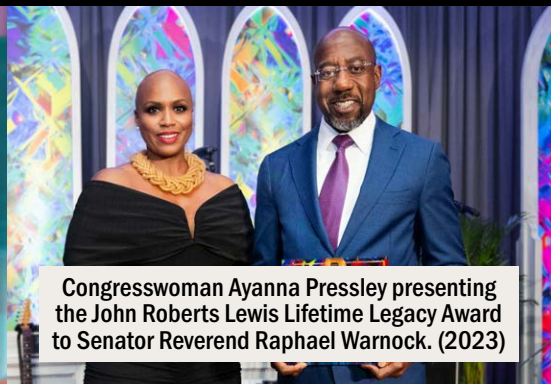
Congresswoman Ayanna Pressley presenting the John Roberts Lewis Lifetime Legacy Award to Senator Reverend Raphael Warnock. (2023)