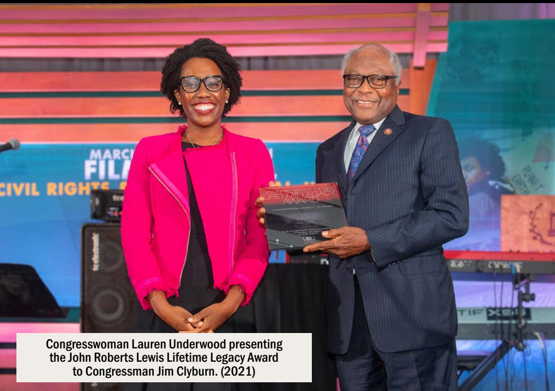
Congresswoman Lauren Underwood presenting the John Roberts Lewis Lifetime Legacy Award to Congressman Jim Clyburn. (2021)