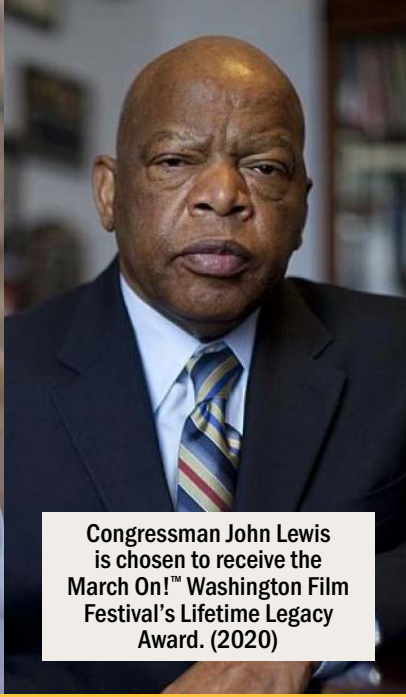
Congressman John Lewis is chosen to receive the March On!™ Washington Film Festival's Lifetime Legacy Award. (2020)