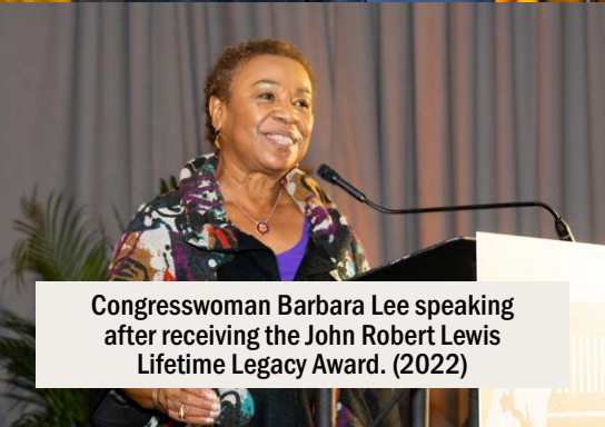
Congresswoman Barbara Lee speaking after receiving the John Robert Lewis Lifetime Legacy Award. (2022)