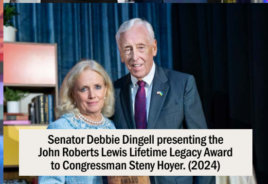
Senator Debbie Dingell presenting the John Roberts Lewis Lifetime Legacy Award to Congressman Steny Hoyer. (2024)