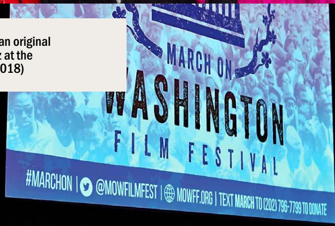
National Youth Poet Laureate Amanda Gorman delivering an original composition honoring poet and activist Sonia Sanchez at the National Archives during the March On!™ Festival. (2018)